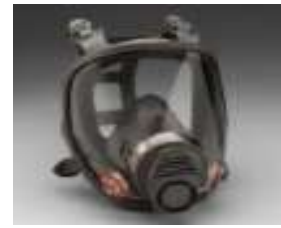
Full facepiece respirator (npf=50)