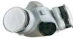
Half mask respirator (npf=10)